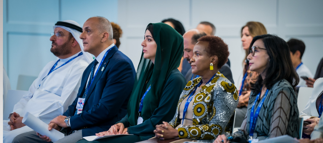
The First Conference of Countries Hosting the World's Humanitarian Hubs on the margins of COP28 in Dubai, December 2023